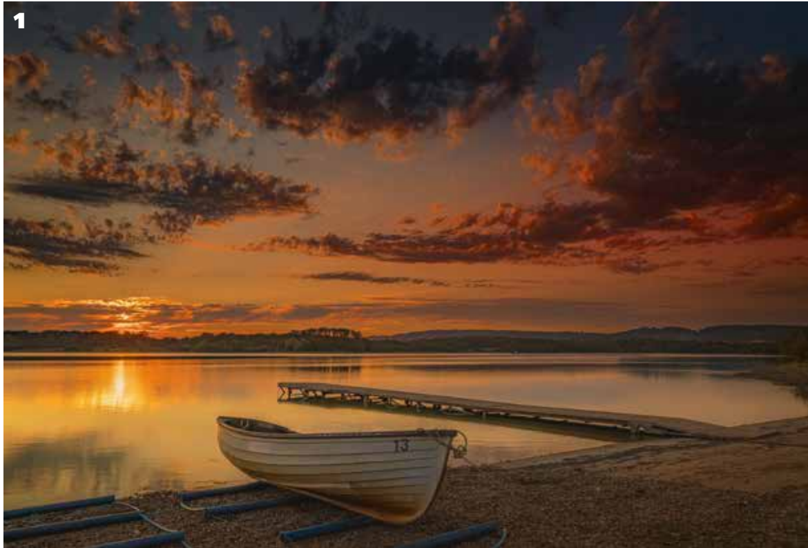
1 Bough Beech Sunset